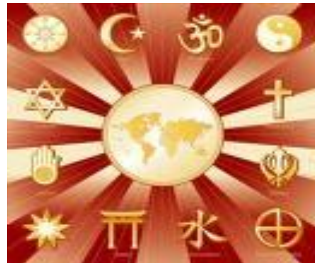
One World, Many Faiths

This curriculum offers flexible sessions to explore history and development of different faith traditions. The youth plan their own program by choosing which religious groups to learn about, visit and relate to their own growing faith. This will include visiting other faiths, creating worship experiences and more.